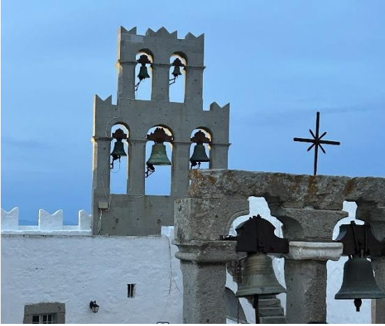
The Monastery of St. John