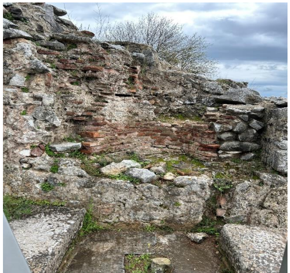
John – Revelation